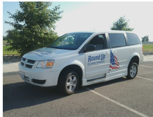
Round Up Wheelchair Van

For trips outside of the Fresno service area or between Fresno addresses, passengers can coordinate with Fresno Handy Ride. See the map on the reverse side for the service area boundaries.