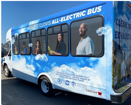
Round Up All-Electric Bus